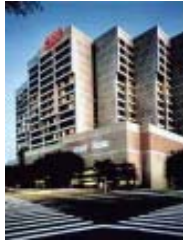
The Omni Hotel at CNN Center Atlanta, Georgia