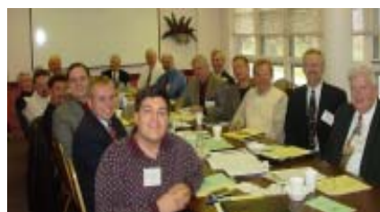
Midwestern Regional Deans' Conference Kansas City, MO

Nineteen newer AABC presidents came to Orlando on October 24-26 for the second Presidents' Leadership Development Conference. The weekend focused on presidential responsibilities and expectations, skill development, and problem solving. The program included plenary sessions, case studies, small groups, and round table discussions. The instruction and mentoring was provided by veteran presidents from within the Association. The evaluations from this conference were very positive and will assist in the planning of future leadership events. ❖